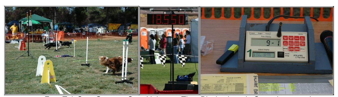
FarmTek Start Gates Start Lights Time Display board Operating console