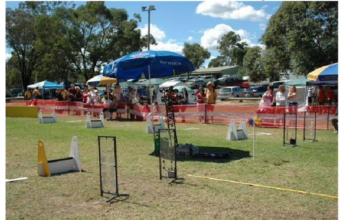
The EJS does not have a display board for times