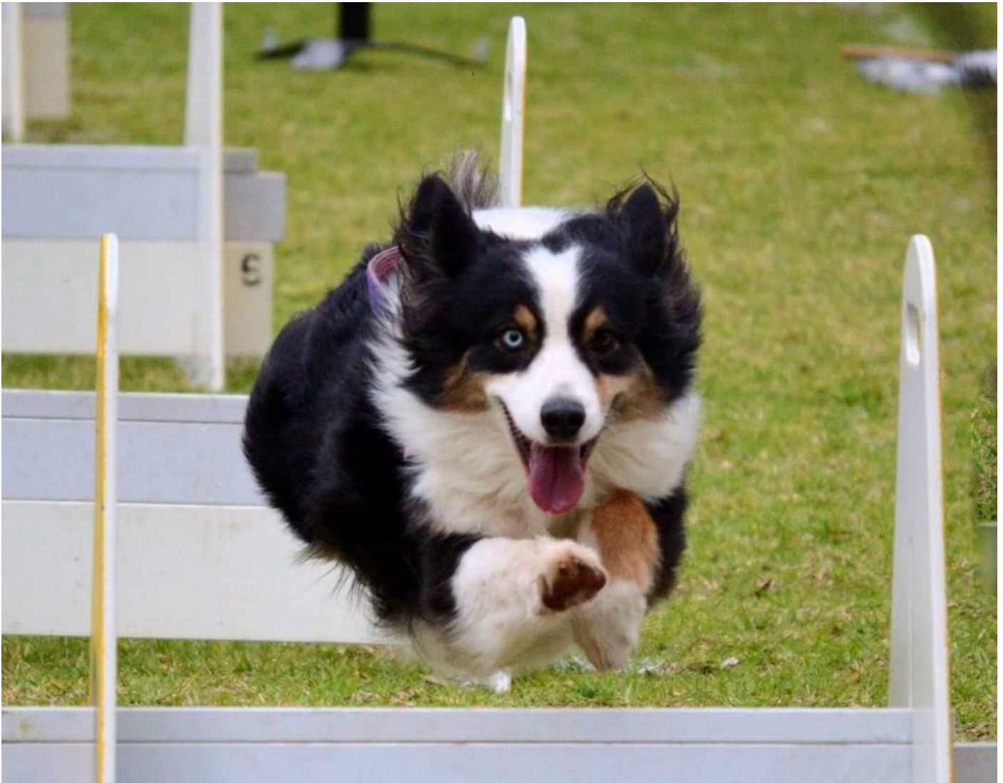
Itty Bitty FDCh

Adelaide Showgrounds, Dairy Cattle Judging Lawn Leader St, Wayville SA