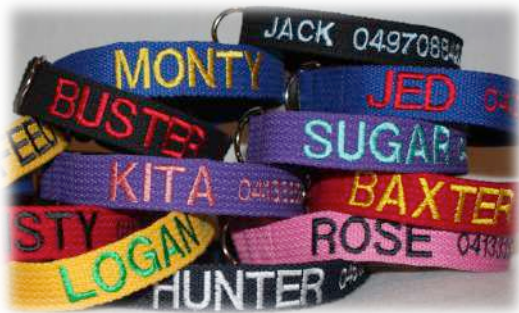
Just Pawfect Leads and Collars

Beautiful custom made collars, leads and harnesses custom designed to suit your needs and personalised with a message of your choice.