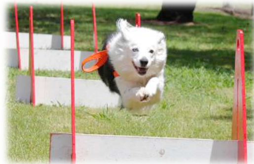
Just Pawfect Flyball Gear