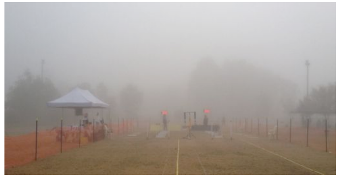
Day 2 - Fog