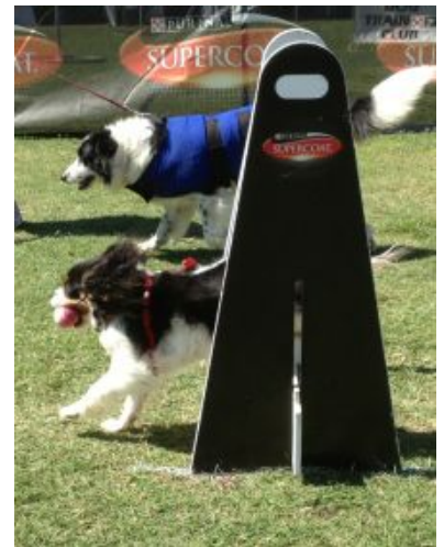
Newbie runs with a "distracter"

Tuggeranong Howling Torpedoes division 8.