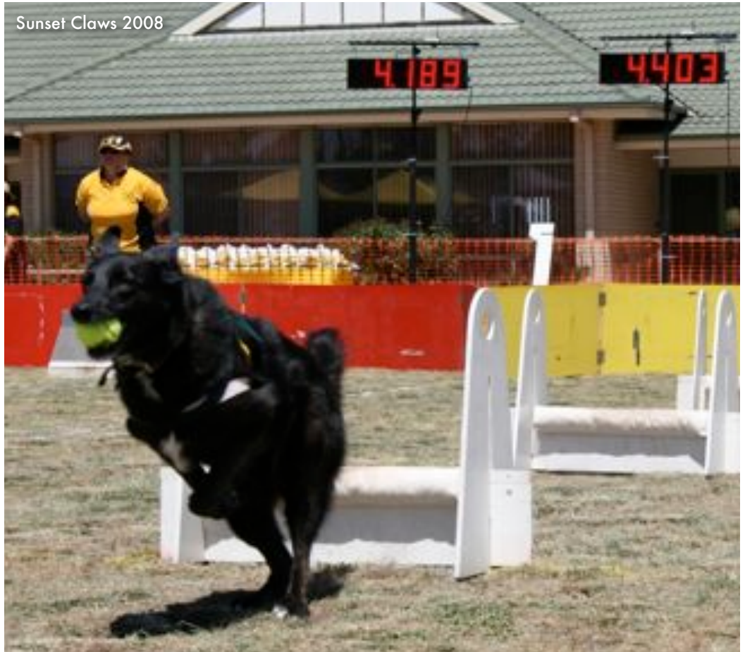
Sunset Claws 2008