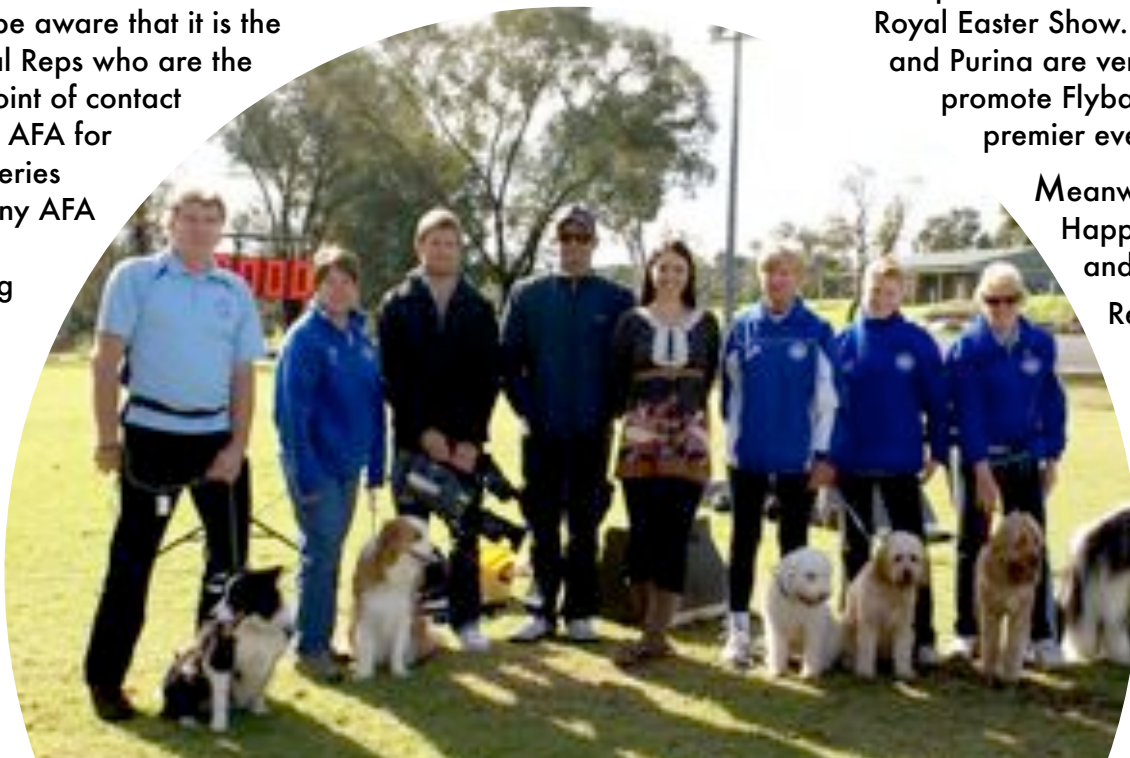
The Crew of 'Totally Wild' with our newest TV stars - Flyballers