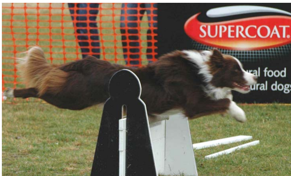
Flying High: Buddy, a chocolate and white border collie is in the Norwest Thunderdogs 1 teams which won Division 1 of the Nationals in the recent flyball championships. He is now a national champion for Division 1.

Flyball is a relay race between two teams of four dogs. Each dog must go over four hurdles, trigger a flyball box pedal to release a ball, catch the ball, retrieve it and return over four hurdles back to the start/finish line where the next dog eagerly waits to perform the same ordeal.