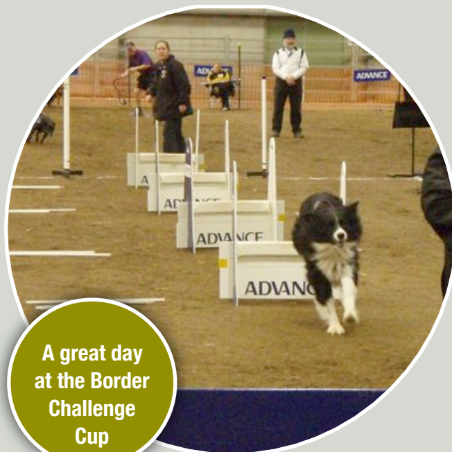
A great day at the Border Challenge Cup

Victorian teams Western Weiners, Bellarine, Eastside Flyers and some members from T'Keilor flyball teams travelled north to Wodonga for the Border Challenge Cup on Saturday 21 July. There were 16 teams in all, including teams from Sydney & Canberra. The Border Challenge Cup was hosted by the Albury/Wodonga Flyball Team.