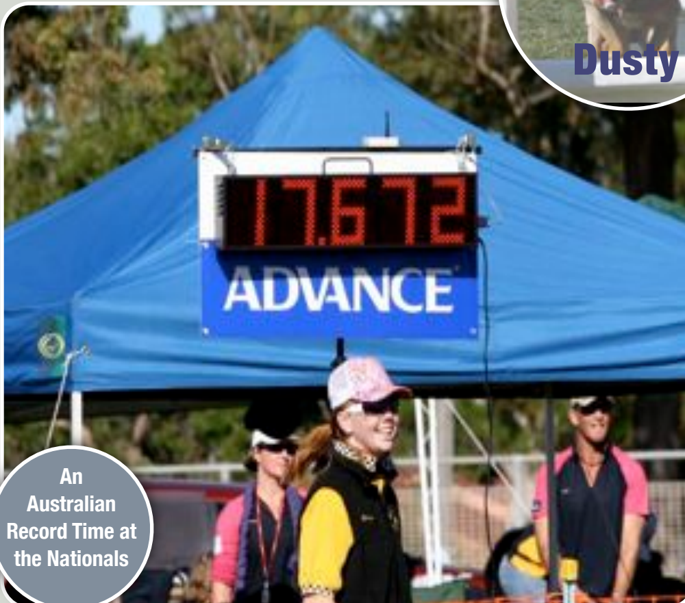
An Australian Record Time at the Nationals